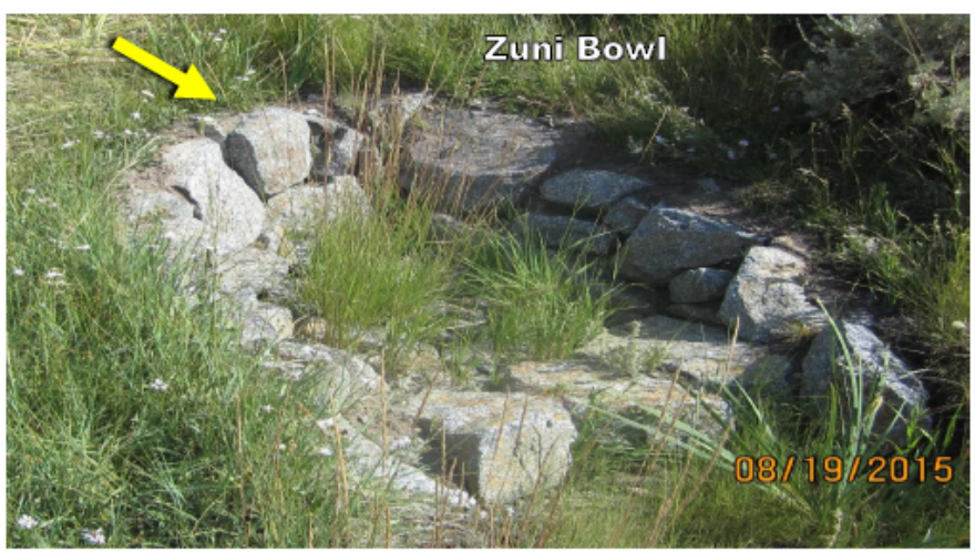
Figure 7. It is critical to ensure the top rocks of the Zuni bowl wall match the existing elevation of the headcut pour-over (denoted by yellow arrow). This helps irrigate vegetation at the lip, allowing it to become the most vigorous instead of the weakest point subject to erosion. If rocks are too high, they divert water around structure, concentrate flow, and potentially cause new gullies. If rocks are too low, soils and roots are exposed and vegetation dies.

The Zuni bowl is a rock-lined, step falls with plunge pools used to dissipate the energy of falling water and stabilize a headcut (Fig. 7, 8, 9). These structures stabilize the progression of a headcut by both stepping down the water in a way that minimizes the erosive and scour potential of falling water, and by protecting and maintaining moisture and vegetation at the pour-over. Hand-built Zuni bowls are typically applied to treat in-channel headcuts (1.5-3 ft tall). See Appendix A for construction specifications.