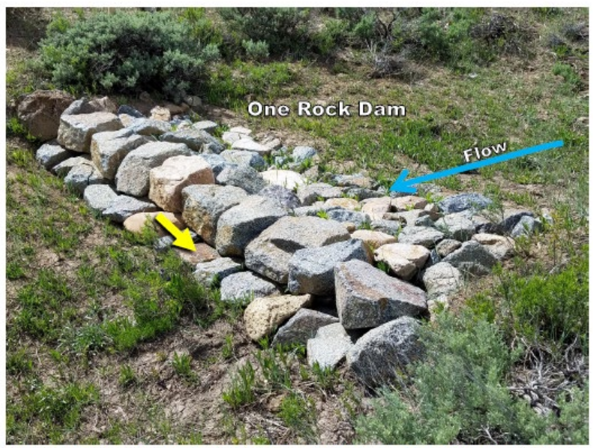
Figure 14. One rock dams should have a footer for splash apron on the downstream end that extends far enough to intercept water pouring over the structure in a high flow event (denoted by yellow arrow).

The one rock dam (ORD) is one of the most commonly used Zeedyk structures for channel recovery (Fig. 14). It effectively slows the flow of water, increases bank infiltration, captures sediment and helps recruit vegetation which can raise the channel bed elevation in gradual increments over time. An ORD is made of many rocks fit tightly together, but gets its name from being only one rock high (generally no more than a third the height of the bankfull channel).