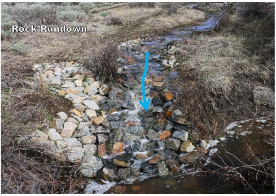
Figure 10. The center of a rock rundown should be the lowest so water runs down the middle and not around the structure.

The rock rundown structure is used in low energy headcuts (< 1.5 ft tall) in small catchments and offchannel return sites to stabilize them and prevent upstream erosion (Fig. 10). Typically, the headcut is first laid back by shaping it to a stable angle (3:1 slope), and then the slope is armored with rock. In some small headcuts, shaping is not required. See Appendix B for construction specifications.